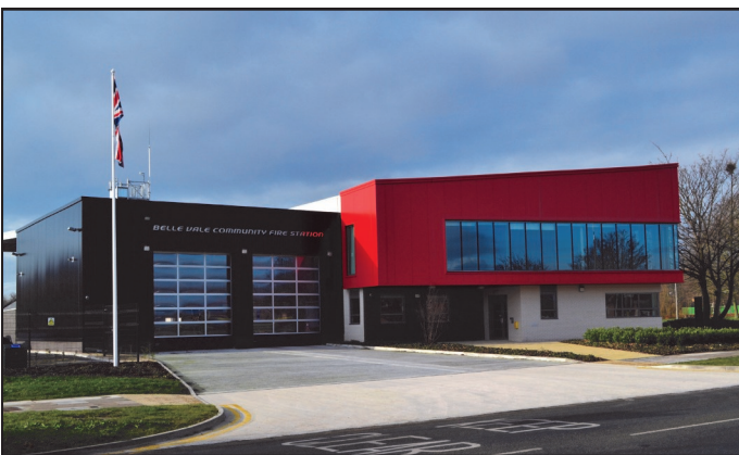
Existing Station design similar to proposed Prescot Site

MFRA has already carried out engagement with the public in Knowsley. Public meetings were held in Huyton and Whiston and a forum of Knowsley residents also considered alternative ways of making the cuts necessary to meet our grant reduction.